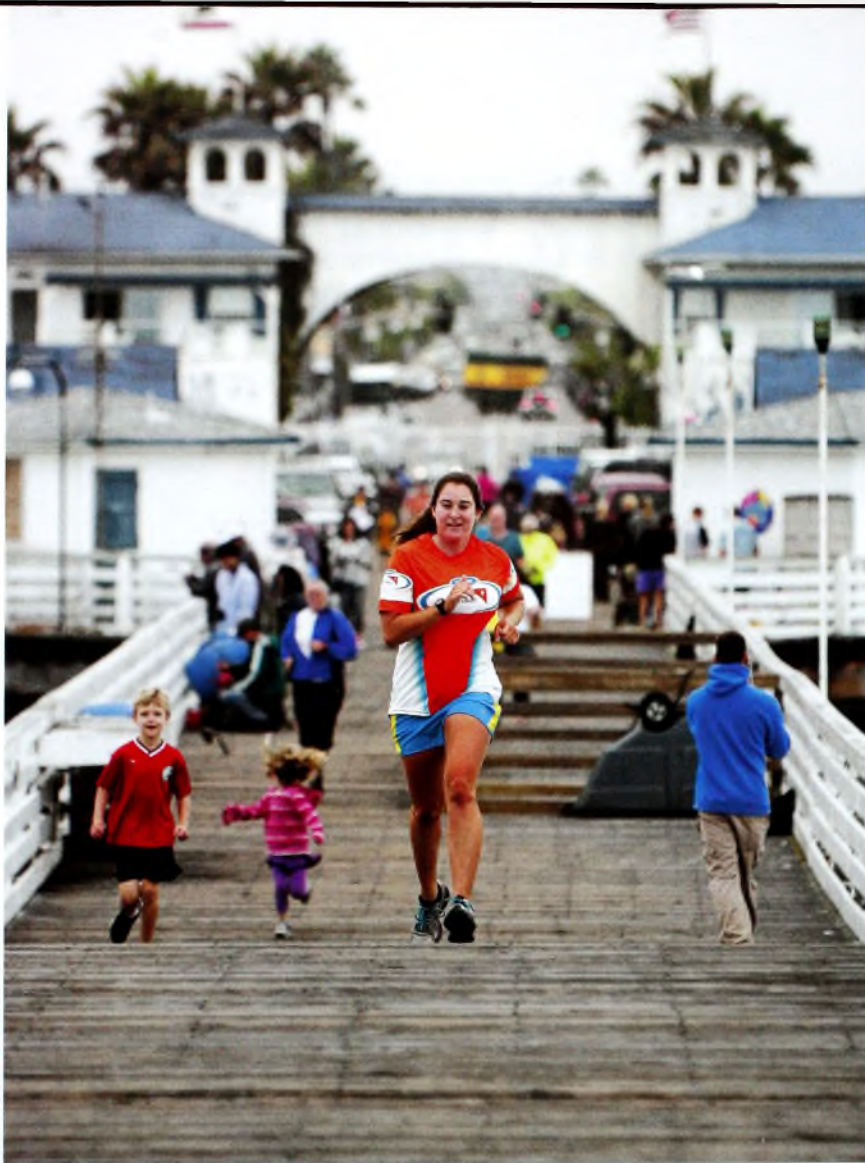
WALLY NELLIGEMIS PHOTOS